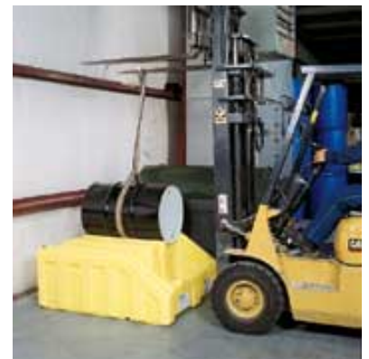
3. Once drum is placed securely on the Poly-Racker, remove cinch strap and back away.