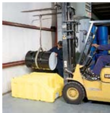
2. Guide drum and orient onto the Poly-Racker.