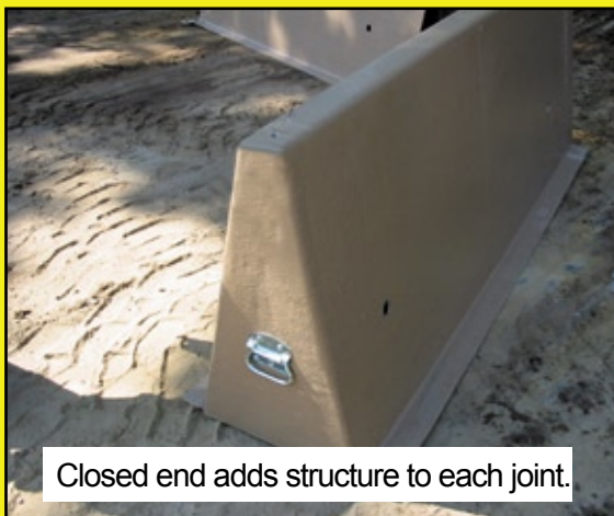
Closed end adds structure to each joint.