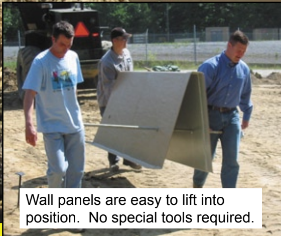
Wall panels are easy to lift into position. No special tools required.

To provide a heavy-duty, re-useable, Fuel Bladder containment system that will withstand a catastrophic bladder failure, yet is easy to install without special equipment. Able to ship on a single A.F. pallet; set up in minutes.