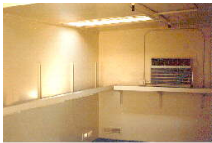
Temperature Controlled Area. Skylights, Shelving & A.C.