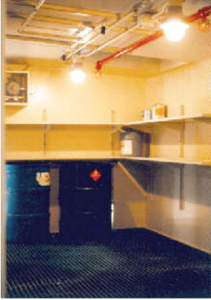
Exp. Proof Lights & Fan. Shelving & Fire Suppression