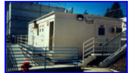
Modular System Installations Buildings, Decking, Stairways, & Loading Ramps.