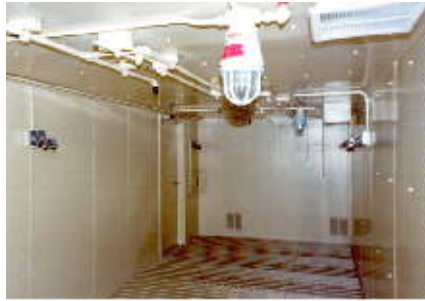
Haz. Location Mixing Areas Lights, Fans & Outlets