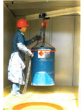
Drum Handling & Hoist Options