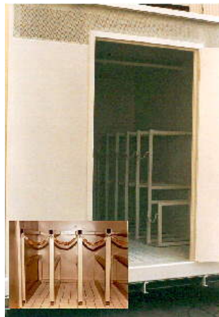
Gas Cylinder Storage Rooms